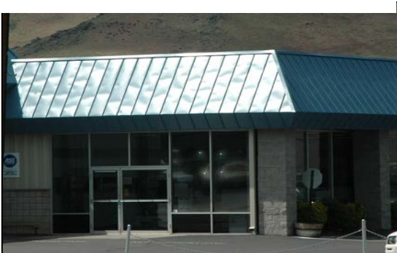
(Above) These photos were taken minutes apart, from different camera angles